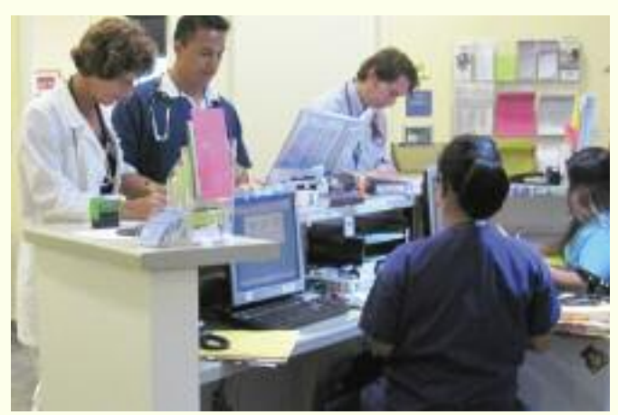
Pediatric Wing in Novato Clinic

All of us at Marin Community Clinics Novato are grateful to the donors who took our dream and made it a reality. We pledge to continually use our creativity and skills to meet the needs of the Novato community.