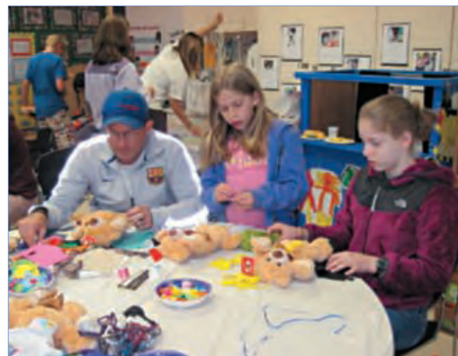
Teddy bears get dressed at Congregation Rodef Sholom Mitzvah Day

As always, our wonderful donors have found creative ways to contribute to Marin Community Clinics. We are grateful for their unwavering and meaningful support.