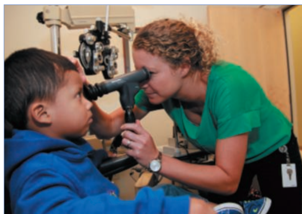
Optometry intern checks eye health of pediatric patient.